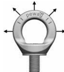
Fig. 1: Permitted directions of load that occur during correct use.

Load: The lifting point may only be loaded in the direction specified (fig. 1), at the maximum load capacity according to table 1 and in accordance with the conditions use specified in this manual.