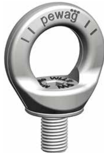
PLGWI basic pewag winner profilift gamma inox lifting point

This operating manual is valid for: PLGWI basic pewag winner profilift gamma inox Dismountable lifting point